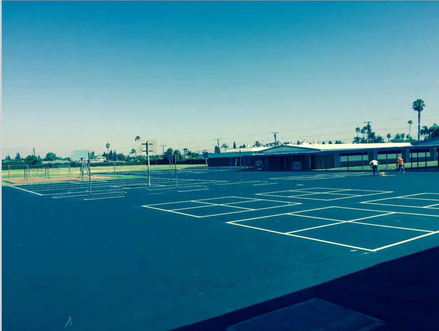
Anthony Elementary New playground surfacing and striping