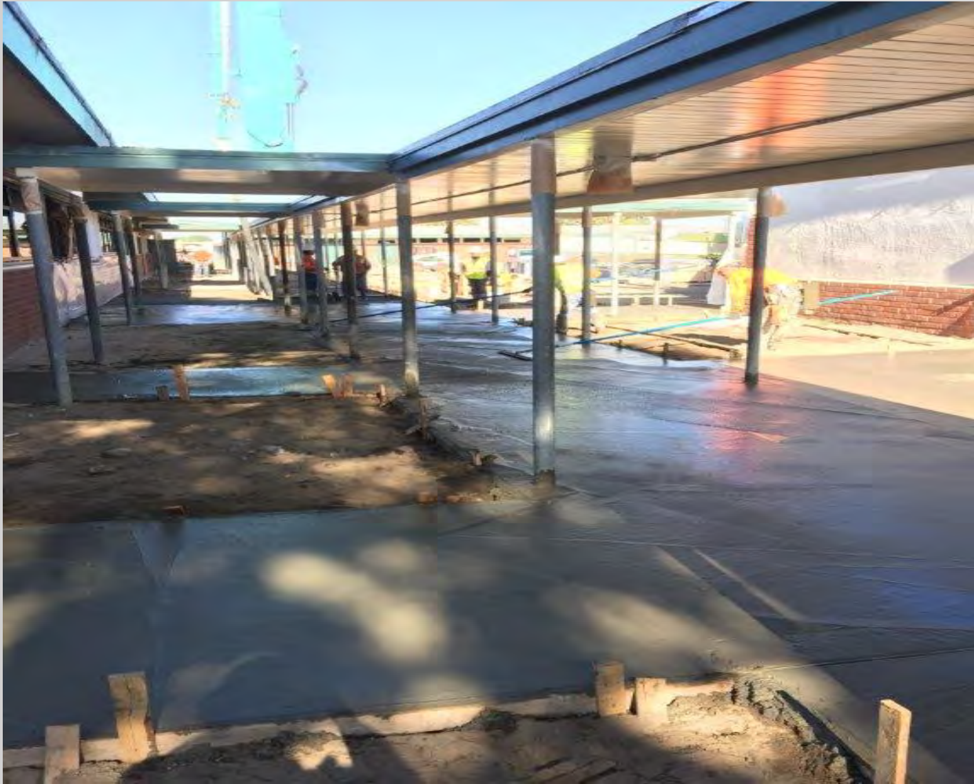
Hill Elementary New concrete being placed