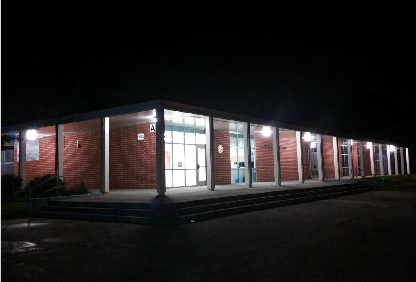
La Quinta HS Administration with Emergency Lighting