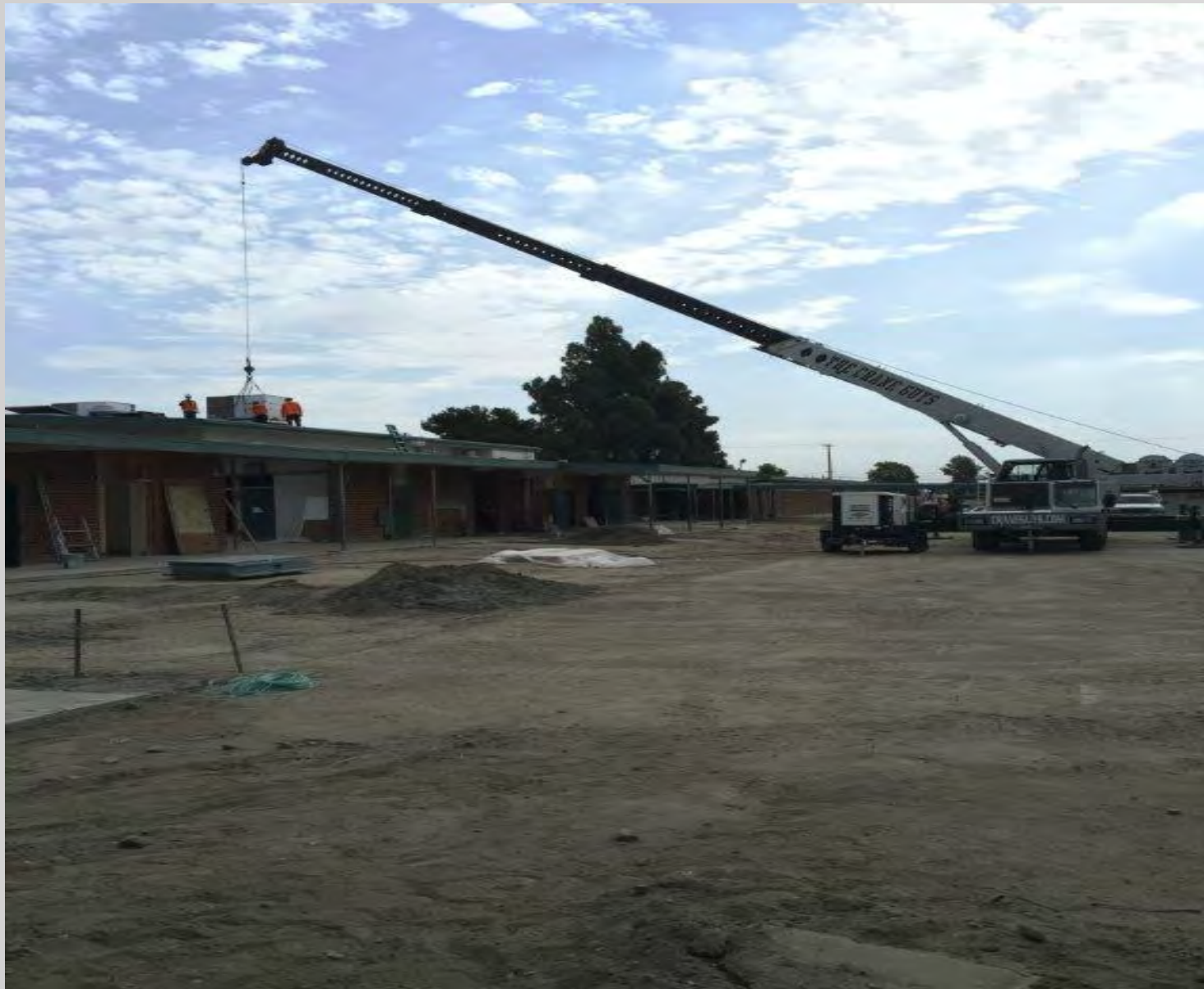
Patton Elementary HVAC units going on the roof