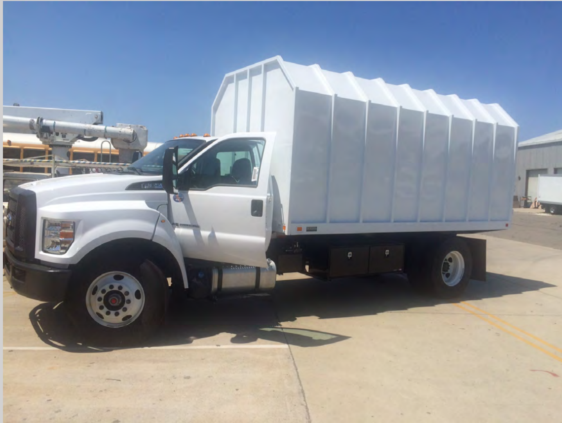
New chipper truck