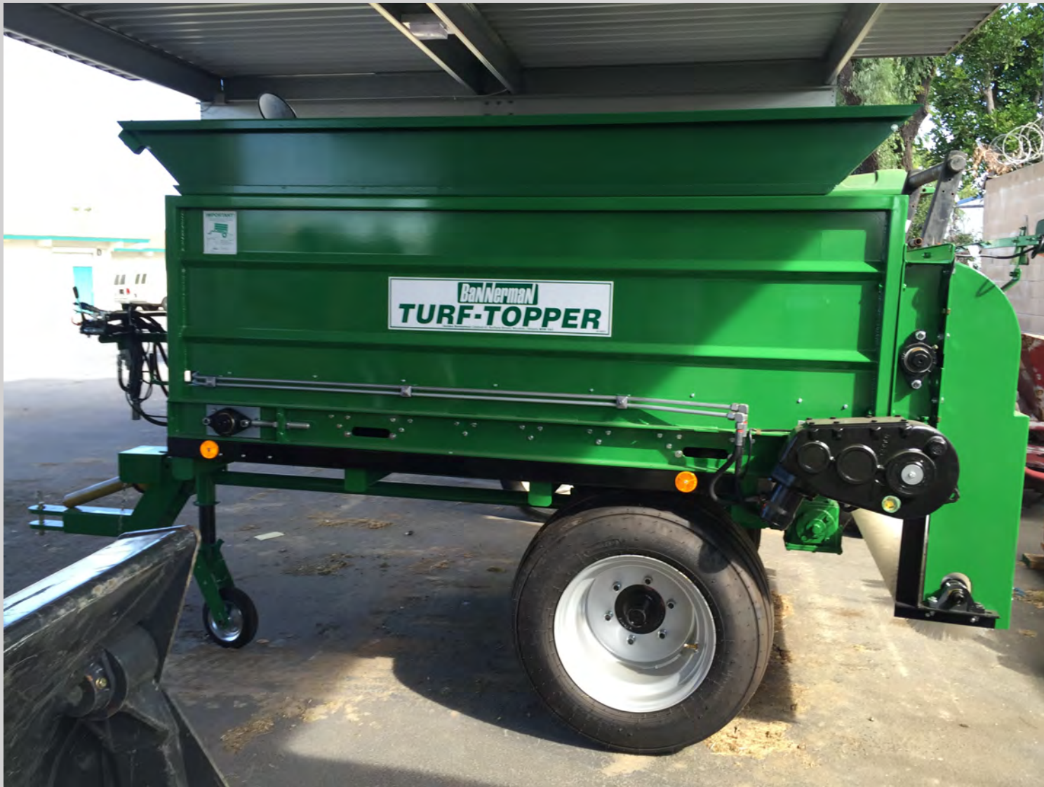
New turf topper

Maintenance, Operations, and Transportation study