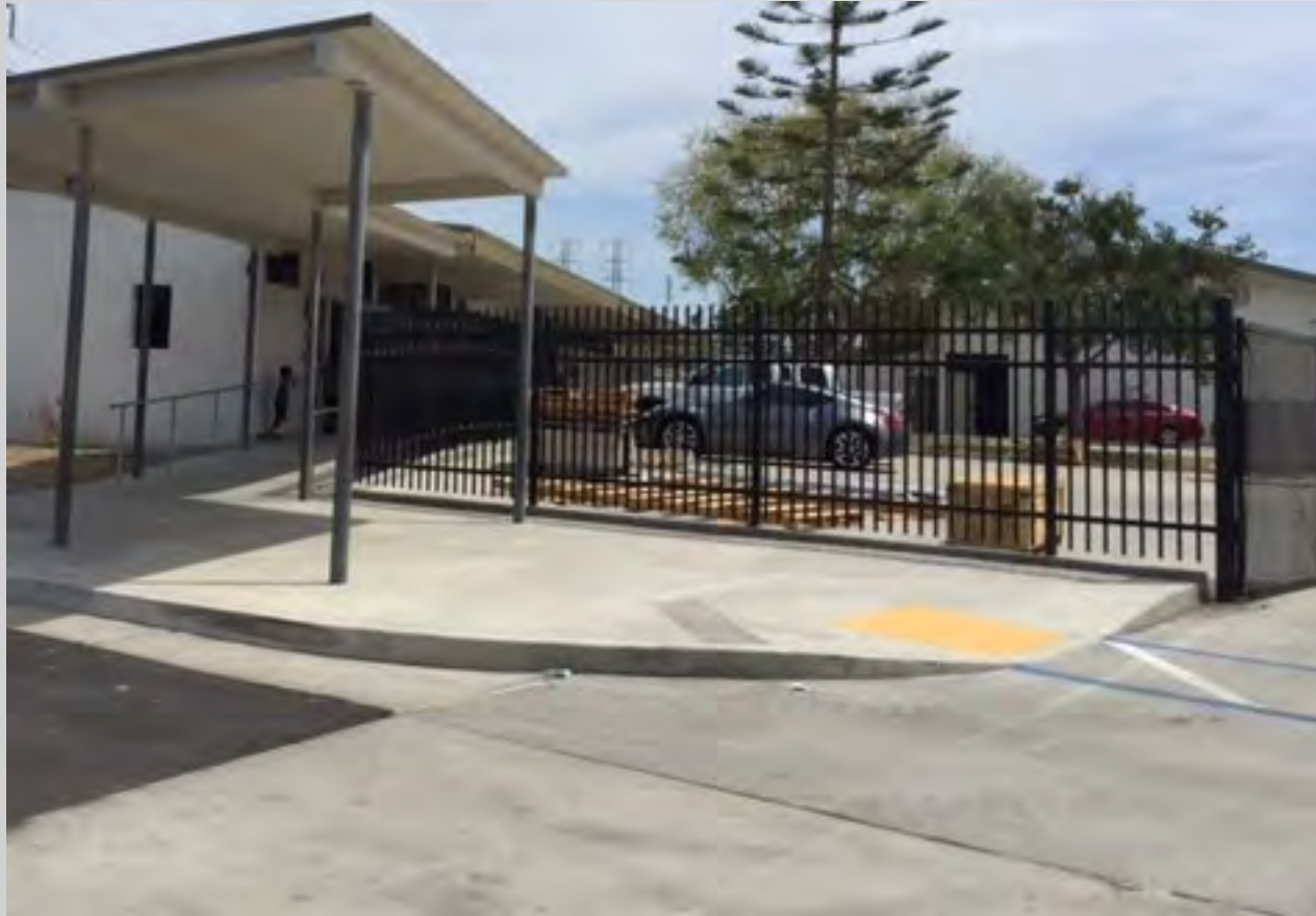
Carver Campus New main office located at front