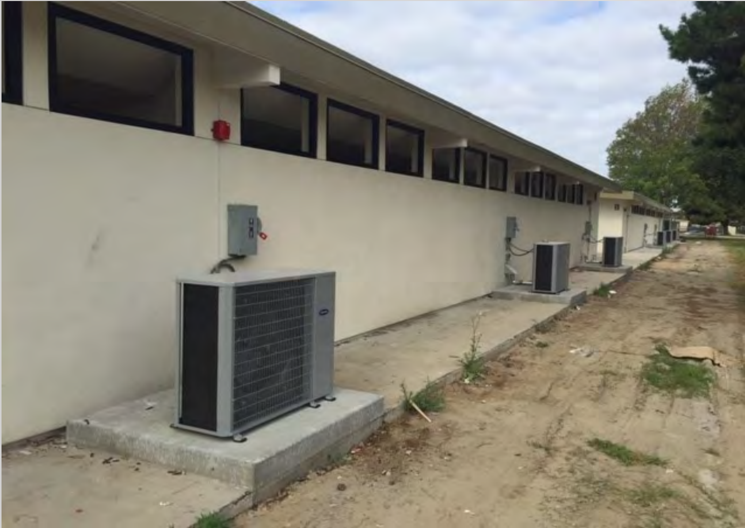
Carver Campus New Air Conditioning condensers