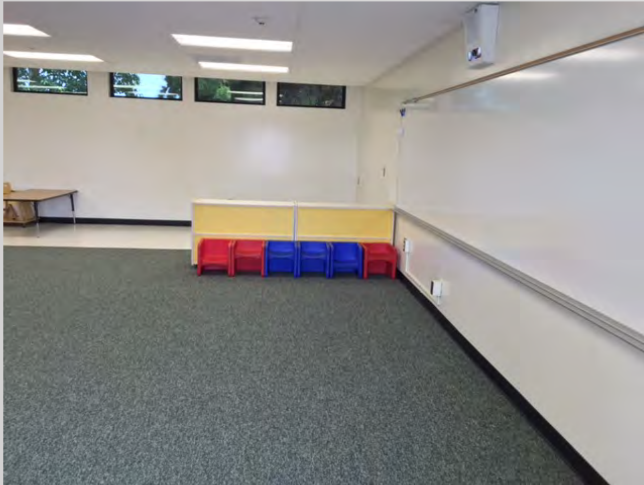
Carver Campus Typical modernized classroom