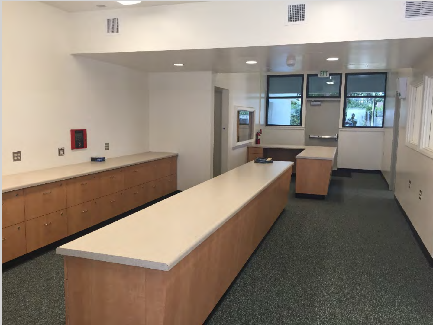
Doig Intermediate Completed office, ADA casework, HVAC, Lighting, Windows