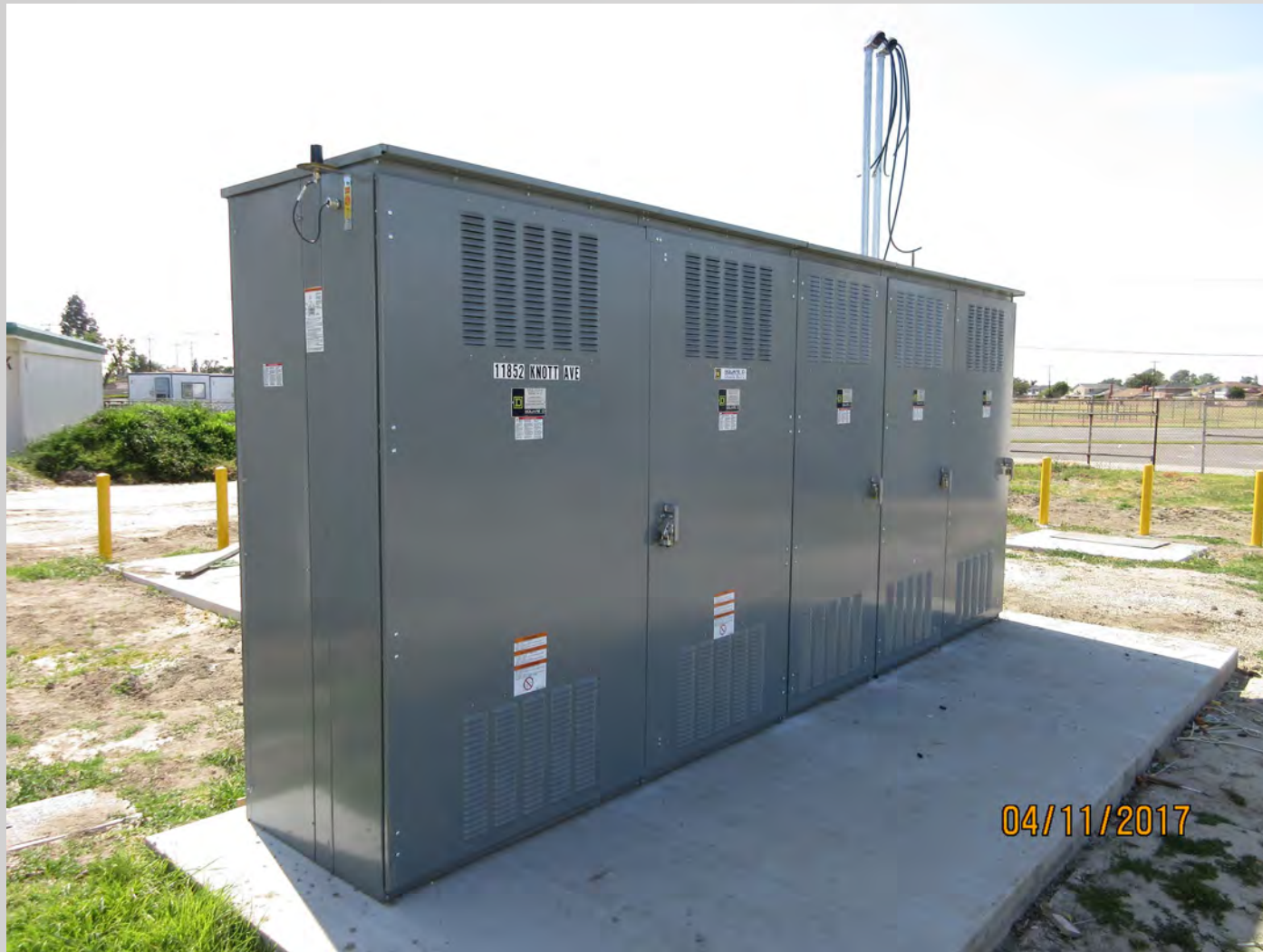
New utility boxes