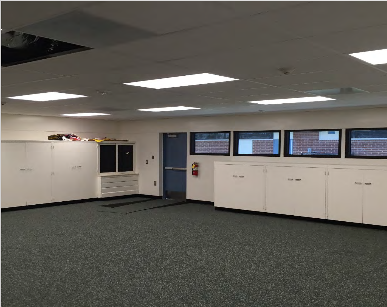
Anthony Elementary Typical classroom