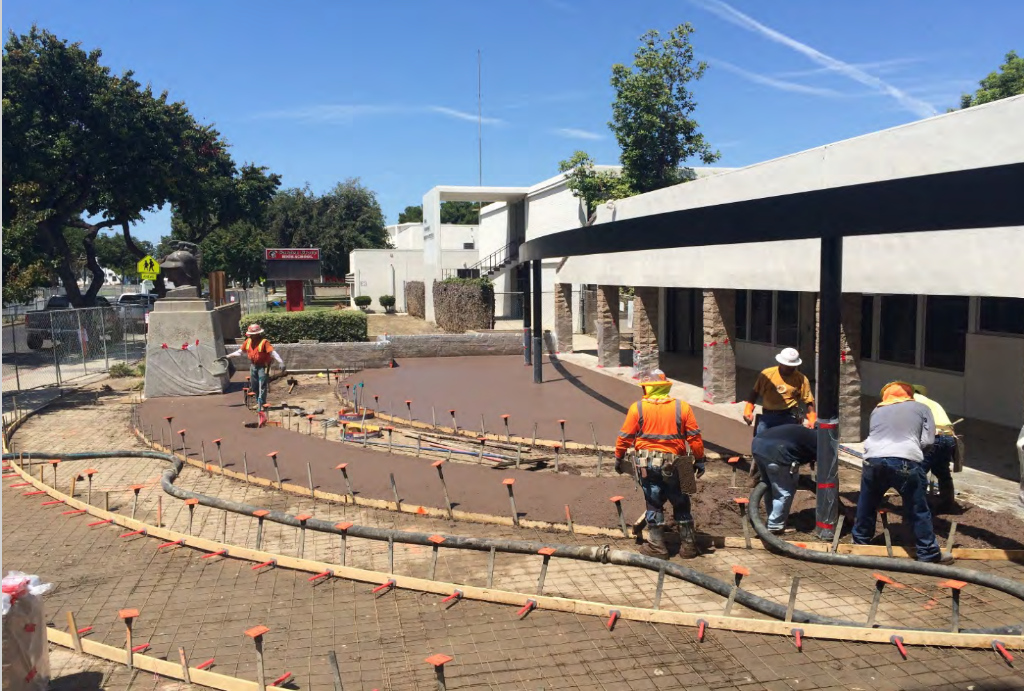
Garden Grove High New Administration entry way concrete